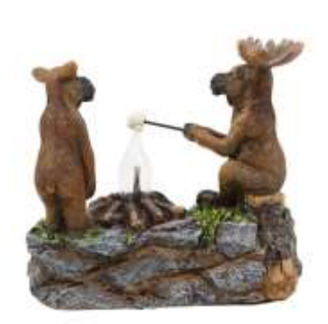
Moose Riders Bonfire

ACTIVITIES Highway Clean-up 3<sup>rd</sup> Sunday of the Month April through October at 9:00 AM